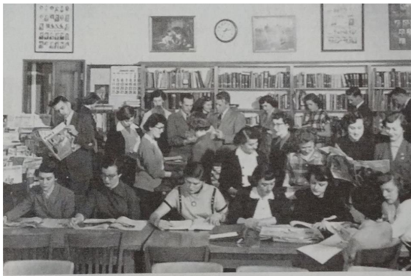
Students pose in the library, which was then in Powers Hall. (Washingtonia 1952)

The Library was initially housed in Powers Hall. In 1936, a fire destroyed the building. Powers Hall was rebuilt in 1937, and again housed the library. The current Merrill Library was built in 1961 at the end of what was then the new classroom building, Torrey Hall. In 1989, Merrill Library was considerably expanded and upgraded.