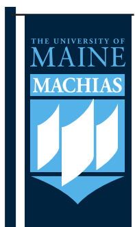
POLE BANNER example