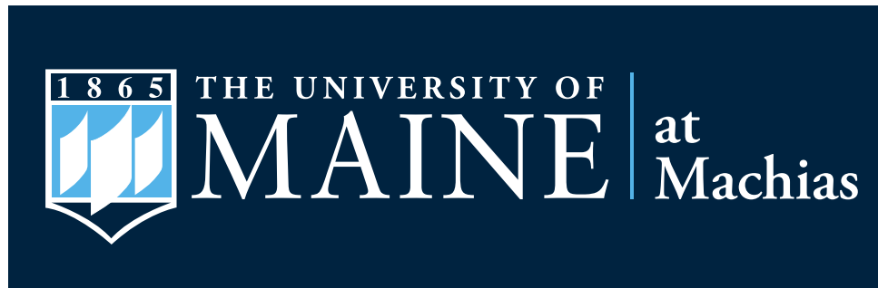
Full UMaine Machias reverse 2 colors: PMS 289 and PMS 292